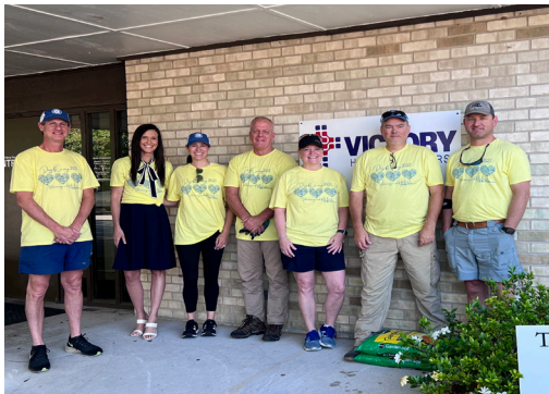
Hancock Whitney's Day of Caring team at partner agency Victory Health Partners.

Beard Equipment Company Hancock Whitney Huntsman Kimberly Clark PNC Financial