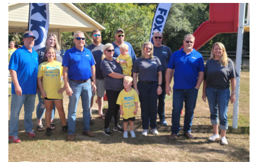
SSAB volunteers at the Playground Project Ribbon Cutting in Mount Vernon.