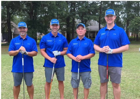
Performance Energy Services team at the Annual Williams Golf Tournament.