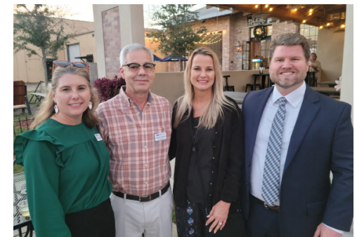
Board trustees at the Annual Holiday Board of Trustee Social.