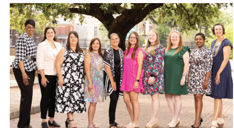
United Way of Southwest Alabama team