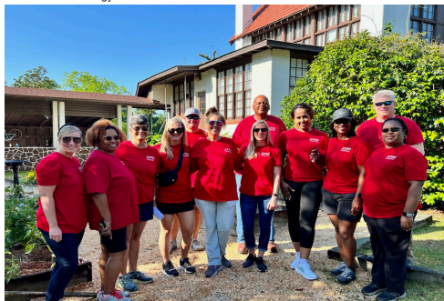
Alabama Power Service Organization at partner Wilmer Hall Children's Home.