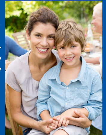
Parent of 4th grader with Epilepsy in Clarke County