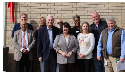
Board trustees after a monthly meeting at the United Way office.