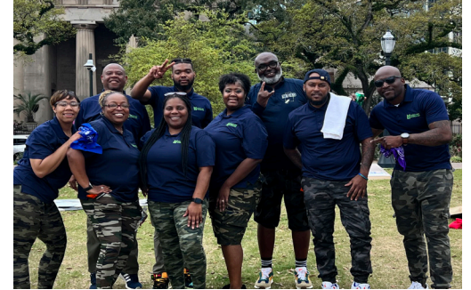
City of Mobile employees at Fun Day