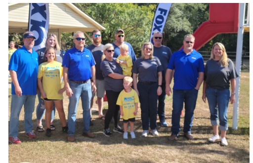
SSAB volunteers at the Playground Project Ribbon Cutting in Mount Vernon.