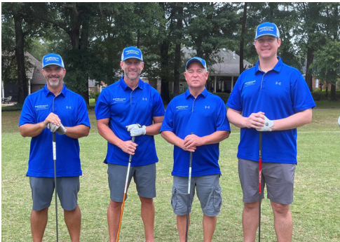
Performance Energy Services team at the Annual Williams Golf Tournament.