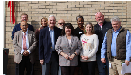
Board trustees after a monthly meeting at the United Way office.