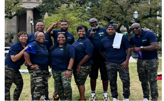
City of Mobile employees at Fun Day