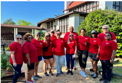
Alabama Power Service Organization at partner Wilmer Hall Children's Home.