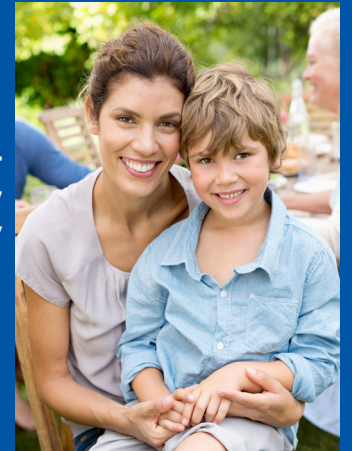
Parent of 4th grader with Epilepsy in Clarke County